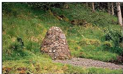
A cairn on the old road from Ballachulish to Duror marks the place where the factor was shot

A man with a dun-coloured coat and breeches was seen fleeing uphill from the scene of the crime. He was never captured or identified. The name of Glenure's murderer remains a mystery to this day (although every so often it is allegedly revealed or deduced).