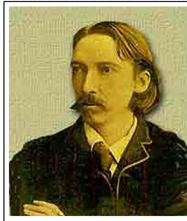
Robert Louis Stevenson 1850 ~ 1894