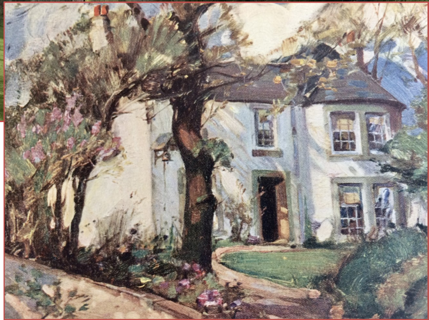
Summer residence: A painting of Swanston Cottage done in 1914

The 'Hills of Home' inspired his writing, including poems such as Ille Terrarum and A Mile And A Bittock , while Swanston Cottage features in