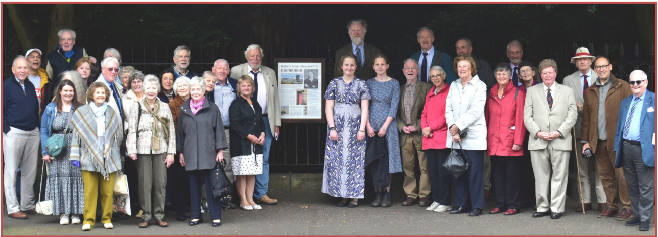
Unveiled: Club members with the new display to remind passers-by of the famous author who lived across the street

FOR the first time since the Covid pandemic, Club members paid a visit to Robert Louis Stevenson's home in Edinburgh for the unveiling of a new plaque to mark the years he spent there.