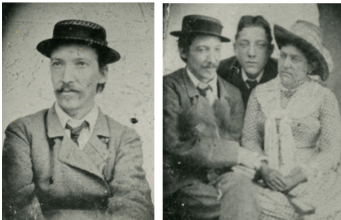
RLS with straw hat and light-coloured double-breasted jacket (reproduced by kind permission of the Robert Louis Stevenson Silverado Museum).